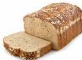
TABLE 1: Minimum Daily Serving Sizes*